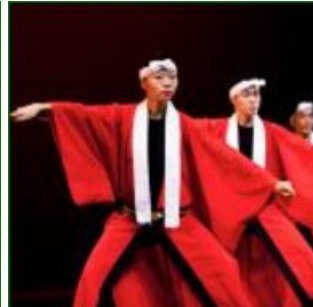
Martial Arts Demonstrations